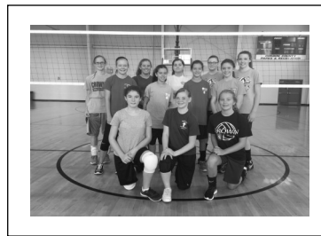
2016-2017 Lady Eagles volleyball team

Aug 19 Away Maranatha Aug 22 Home Cumberland Aug 26 Home Covenant Sept 1 Home King's Way Sept 2 Away Canaanland Sept 6 Home Suwanee Sept 9 Home Canaanland Sept 13 Away GCA Sept 27 Mountain Area Sept 29 Away King's Way Sept 30 Away Old Suwanee Oct 4 Away Victory Oct 7 Home Maranatha Oct 14-15 State Tournament